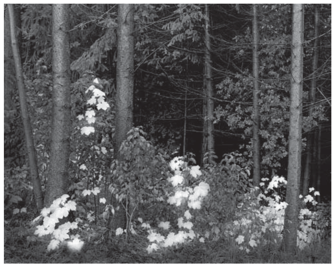
Corteza, Hojas, Villa La Angostura, Río Negro. Argentina 2002. Plate 209. High tones prevail. Sinar 4'' x 5''camera and Sinaron S 150 mm lens. Tri-X Professional 320 film, I.E. 200. Contrast: N-1; low tones in Zone III and high tones in Zone VI. Exposure at f 16 for 1 second with a yellow filter K2 (2X). Expansion developing N+1 using HC-110 developer, dilution 1/31 at 20°C for 6.5 minutes. Printed on Galerie paper grade 3, developed with Dektol 1+3 at 20°C for 3 minutes. Final tone given with selenium 1/16 for 2' 30''.

In 1994, he moved to the United States to study and learn more about Ansel Adams' work. In 2001, he published the book Zone Systems , the result of his fascination with the technique Adams developed around 1940. This system provides a precise method to define the relationship between the way the artist sees the objects and the final result captured by the camera. Fernando tries to make it applicable to the modern, more sensitive materials of the 21st century.