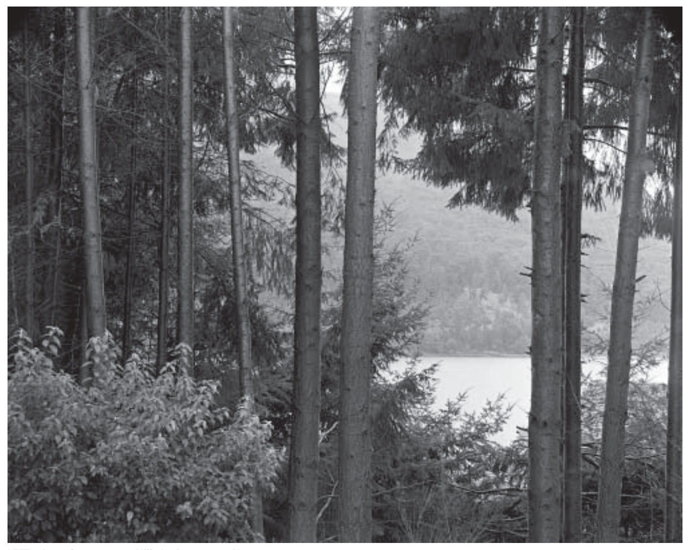
LEFT - "Lago Correntoso", Villa La Angostura, Neuquén, Argentina, 1998. Sinar camera and Sinaron S 150 mm optics. Two 4" x 5" sheets were exposed at f. 16 2/3, for 1/2 second, no filter. T-Max 100 film, I.E. 50. Low tones located in Zone III higher ones in Zone VII. Normal developing using ABC developer at 20°C, for 9 minutes. Printed onto Galerie paper grade 2.

ABOVE - Villa La Angostura, Neuquén, Argentina 2001 "Sinar 4 x 5 camera and Rodenstock 270 mm lens. Tri-x Professional 320 film, IE. 200. Contrast: N+1; low tones in Zone II and high tones in Zone VII. Exposure at f. 22 for 2 seconds. U.V filter plus a middle yellow K2 (2X).Normal developing using HC-110 developer, dilution 1/62 at 20°C for 9 minutes. Printed onto Galerie paper grade 2, developed with Dektol 1+3 at 20°C for 3 minutes. Final tone given with selenium 1/16 for 2.5 minutes.